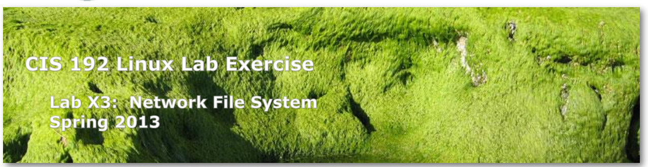
Lab X3: Network File System (Extra Credit Lab)

The purpose of this lab is to share files among hosts on a common network. NFS allows the sharing of files among UNIX/Linux hosts; the goal of this lab is to use NFS to share a directory of files on one machine with the other hosts on the same network.